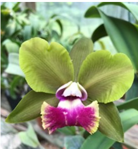
C Crowfield 'Mendenhall'