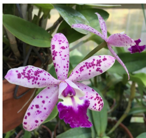
C Tropic Pointer 'Cheetah' AM/AOS