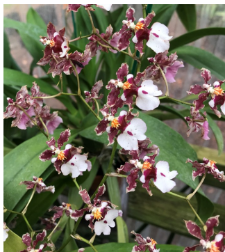
Onc Ruth's Rainbow 'Over the Rainbow'